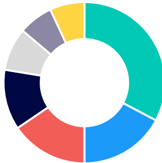
Percent of PAs by Specialty in New Hampshire

Number of PAs in the United States: 190,000