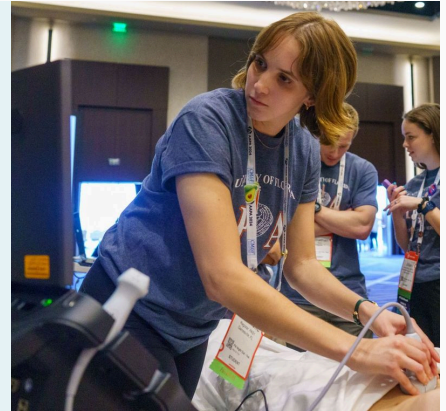
PA students competing in the iSCAN event during AAPA 2024

A: While more and more PA programs are implementing point-of-care ultrasound (POCUS), the current state of POCUS in PA education is quite varied - some programs have a single workshop, others have fully integrated curricula. Given the growing role of POCUS in practice and the increasing expectation that graduates are familiar with it, we felt a need to define minimum standards and priorities for PA education.